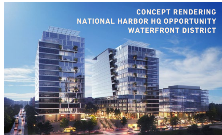
CONCEPT RENDERING NATIONAL HARBOR HQ OPPORTUNITY WATERFRONT DISTRICT