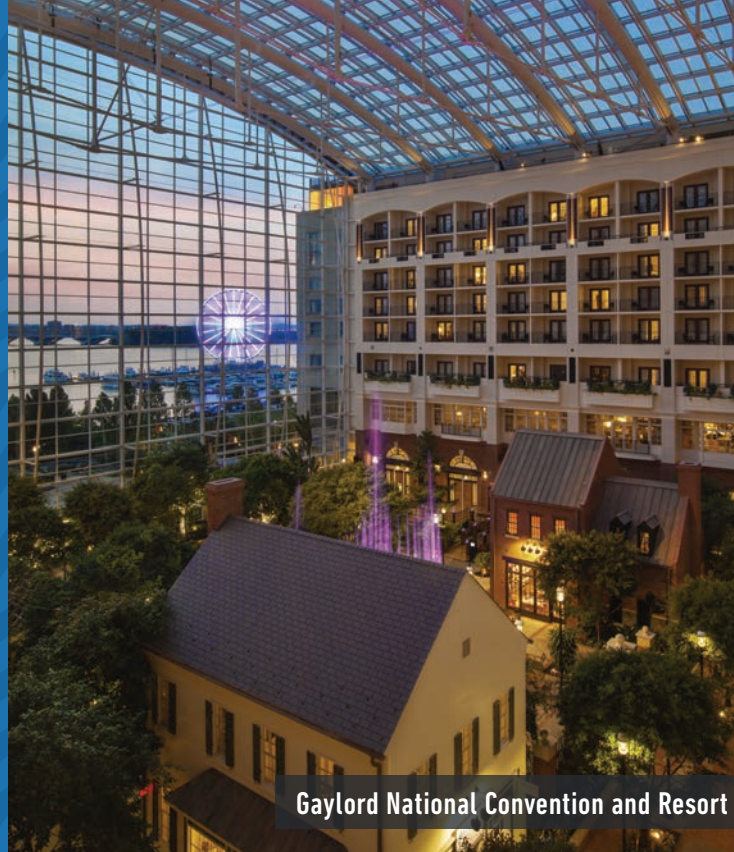
Gaylord National Convention and Resort